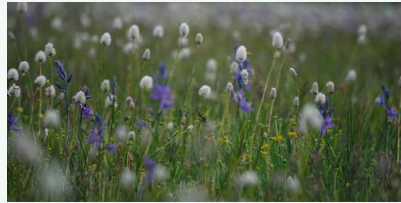
Camas and Bistort